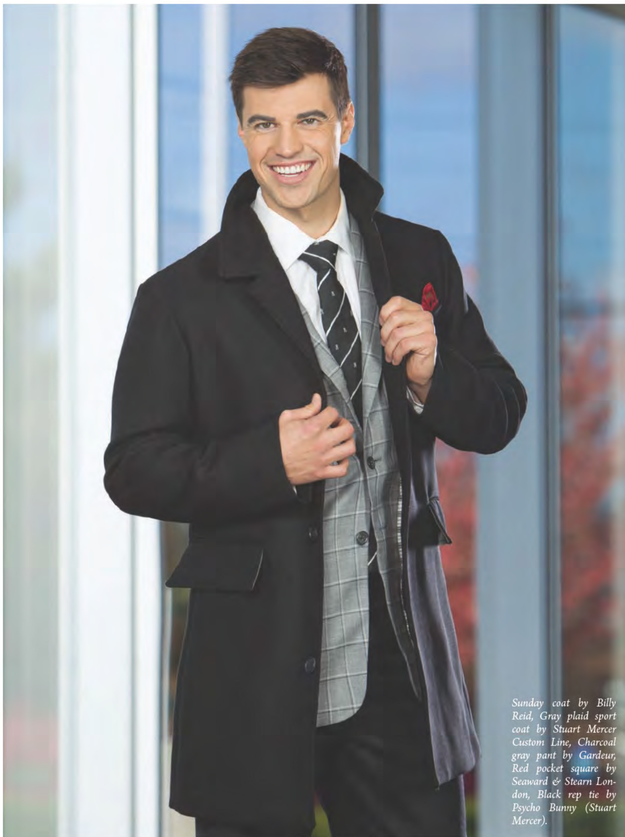
Sunday coat by Billy Reid, Gray plaid sport coat by Stuart Mercer Custom Line, Charcoal gray pant by Gardeur, Red pocket square by Seaward & Stearn London, Black rep tie by Psycho Bunny (Stuart Mercer).