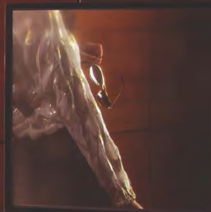
White cheers jacquard top by Elsam (Peppermint Palm); Waverly titanium sunglasses with 22K gold electroplating by David Yurman (John G. Roche); Gold clutch (Sassy Fox); White, rose and yellow gold diamond fashion ring (Shelia Bayes Fine Jewelry).