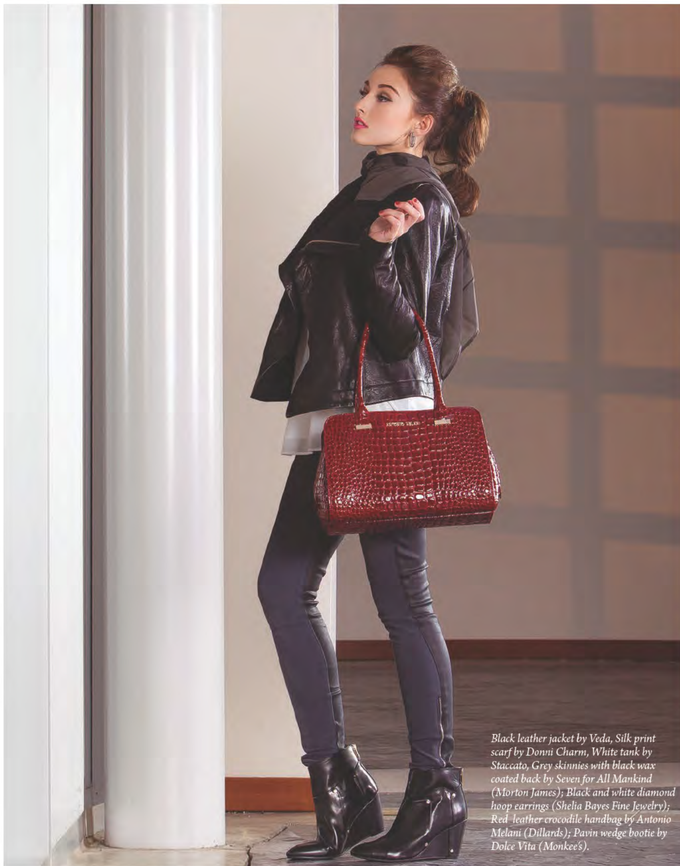
Black leather jacket by Veda, Silk print scarf by Donni Charm, White tank by Staccato, Grey skinnies with black wax coated back by Seven for All Mankind (Morton James); Black and white diamond hoop earrings (Shelia Bayes Fine Jewelry); Red leather crocodile handbag by Antonio Melani (Dillard's); Pavin wedge bootie by Dolce Vita (Monkee's).