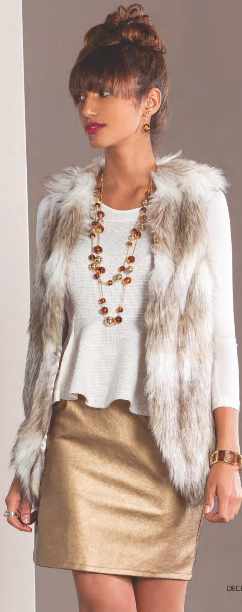
White and gray fur vest by Skies Are Blue, White long sleeved peplum shirt by Gianni Bini, Bronze leather skirt by Cremieux (Dillard's); Beaded necklace, earrings and bracelet (House by JSD); White, rose and yellow gold diamond fashion ring (Shelia Bayes Fine Jewelry).