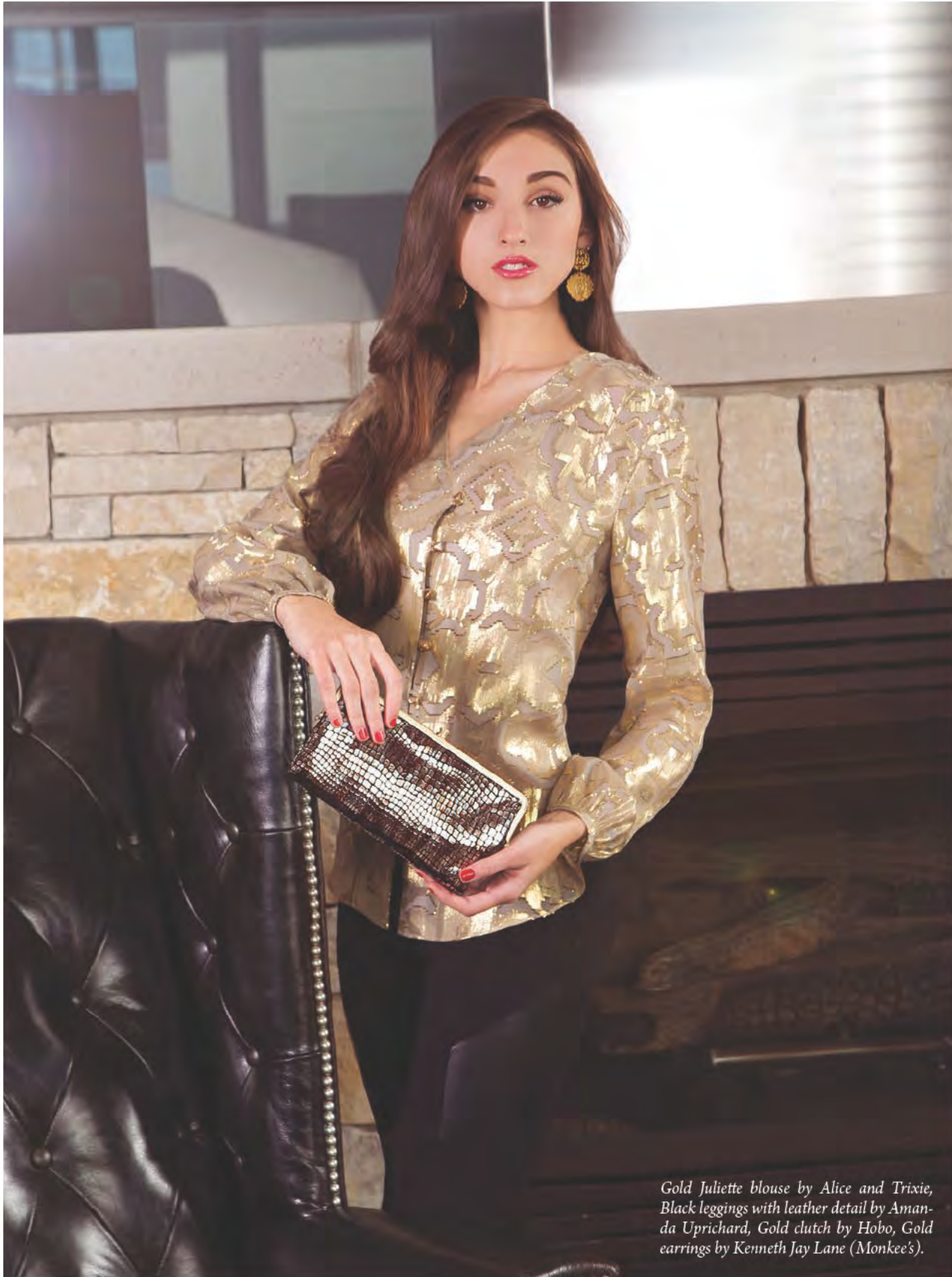
Gold Juliette blouse by Alice and Trixie, Black leggings with leather detail by Amanda Uprichard, Gold clutch by Hobo, Gold earrings by Kenneth Jay Lane (Monkee's).