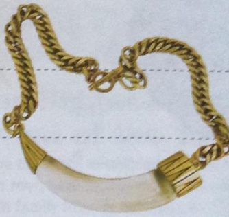
HARK! Horn Collar by Jenny Bird Shine, 301 East Vine Street Suite 160 Lexington 859.687.0630