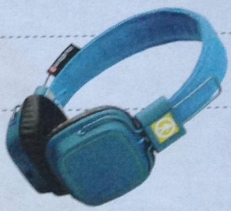
Privates Wireless Headphones J&H Lanmark 189 Moore Drive Lexington 859.278.0730