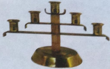
Art Deco Candle Holder Scout 935 Liberty Road Lexington 859.288.5200