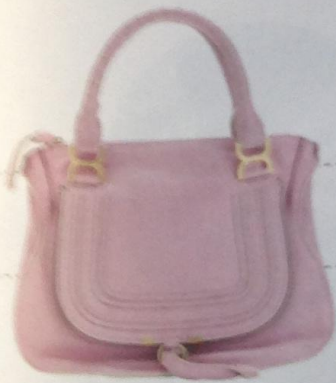
Rosie Bag Versona Accessories 2304 Sir Barton Way 859.264.0377