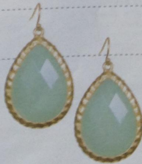
Faux Jade Earrings Charming Charlie 161 Lexington Green Circle, #269 859.373.0067